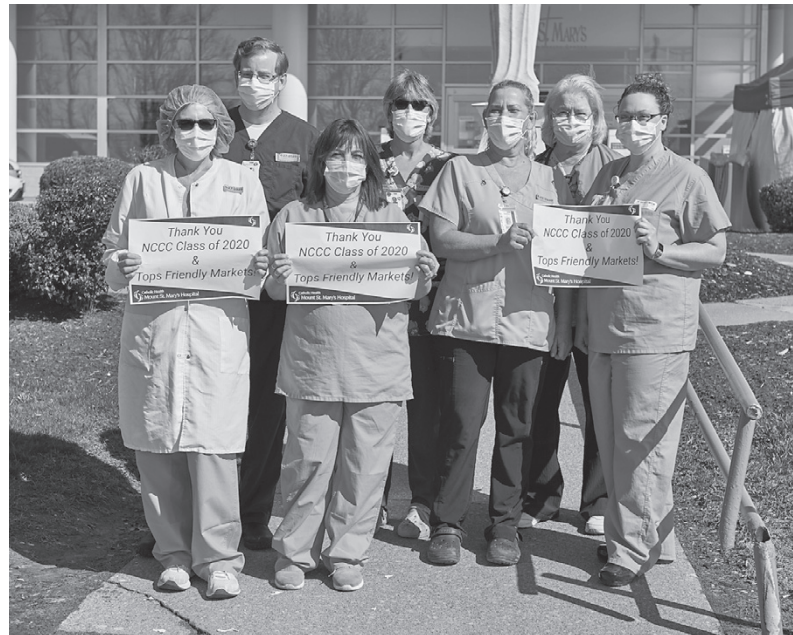
Special cookie care packages were sent out on Monday, courtesy of students at Niagara County Community College.